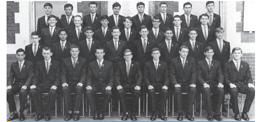
1963 Waverley College Prefects, Peter Cosgrove is in the second front row, fourth from right.