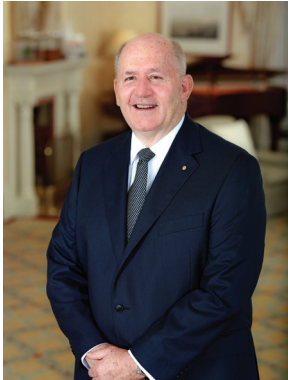
2014 Official image of His Excellency General the Honourable Sir Peter Cosgrove AK MC (Retd), Governor-General Of Australia.

One of Waverley College's favourite sons Peter Cosgrove was appointed Australia's 26th Governor-General in 2014.