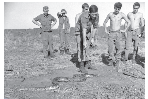
1970 Lieutenant Peter Cosgrove (pointing at snake) with soldiers of the Defence and Employment Platoon, 1st Australian Task Force at Nui Dat, Vietnam.

in 1968, Peter Cosgrove was posted to the 1st Battalion, Royal Australian Regiment (1 RAR) and subsequently served in Malaysia. His next posting saw him commanding an infantry platoon in Vietnam, and he was involved in an action for which he was awarded the Military Cross.