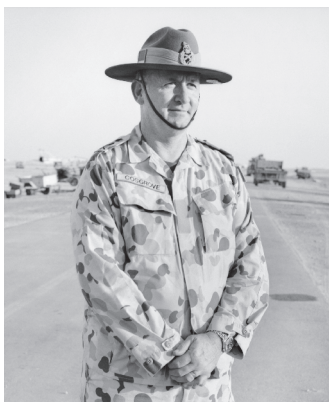
2003 Peter Cosgrove as Chief of the Defence Force, at Al Asad airbase in Western Iraq. Cosgrove was visiting the SAS members stationed there, who had taken control of the airbase earlier. The SAS and 4 RAR operated in the Middle East as part of the Australian commitment to the Coalition forces assembled to disarm Iraq.