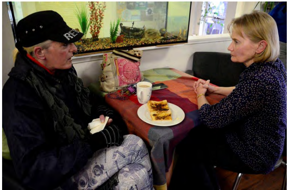
Register now, numbers are limited - Bookings close 8th July 2016

COST: $70 special Kids Giving Back rate (incl. all booking and credit card fees)