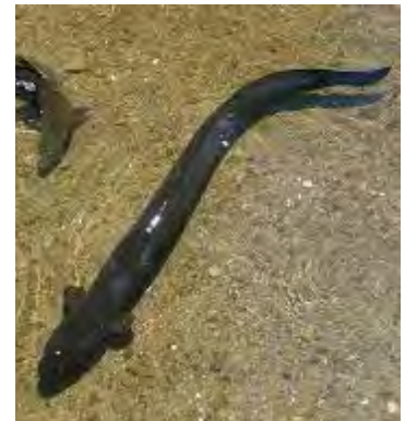
Photo: The Long Finned Eel