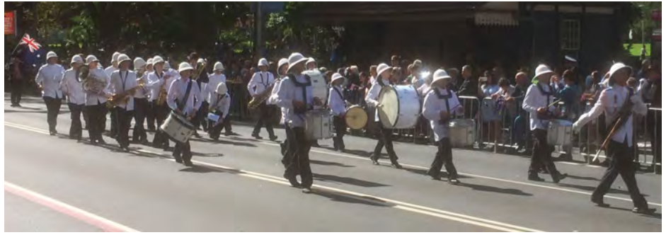
Photo: The Cadet Band and Drum Corp in the 2016 Anzac Day March