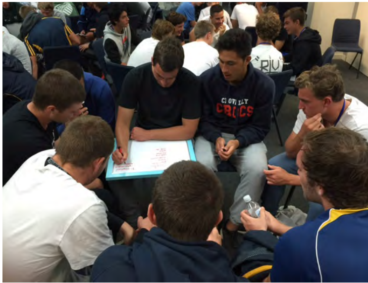
Photos: Left - Some collective goals were established for the season during the Goal Setting evening Below left - The squad gathers at the conclusion of a day's training. United. Below - The squad enjoy an ice bath in the AIS Recovery Centre