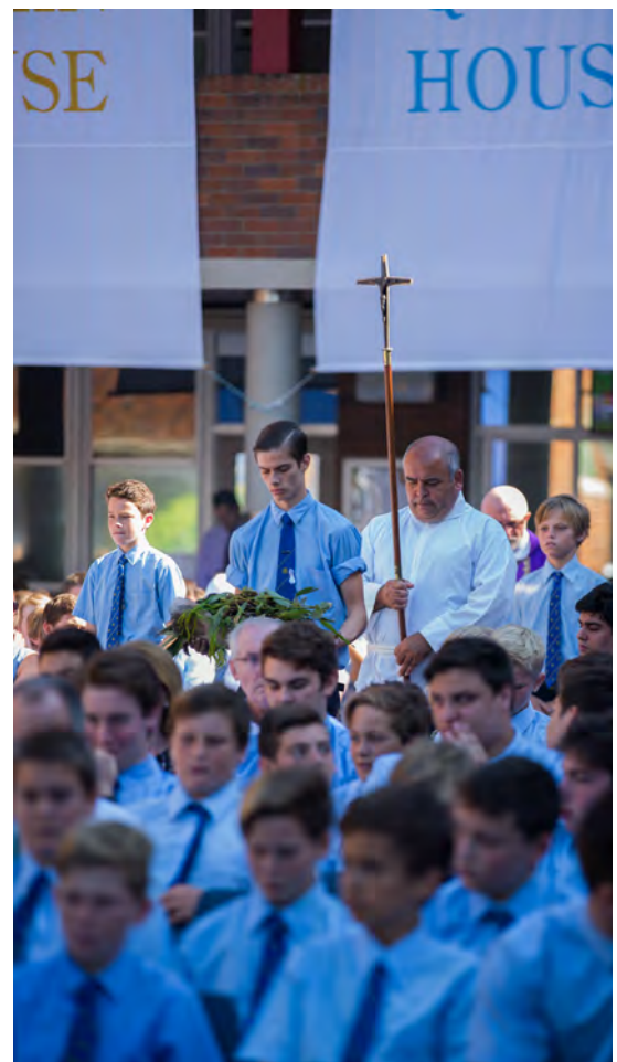
Commencement Mass